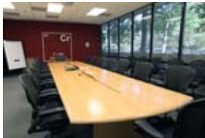
Medium conference room